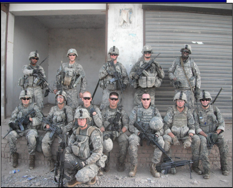
Bayonet soldiers before leaving for a patrol from the OCC-D.

OTHER BAYONET SOLDIERS WILL APPEAR IN THE NEXT ISSUE OF BAYONET NEWS LETTER 2010 HAVE ANY RE-QUEST OR SUGESSTIONS FOR THE ARTICALS ? EMAIL ME AT James.whitten@us.army.mil