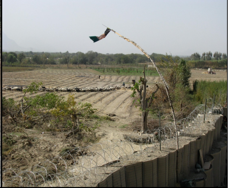
Some sheep herders moving through Bayonet AO with the ANA's Flag in the foreground.

A little help from your buddy is always appreciated for the walls and canals. 3rd Platoon hopping over walls