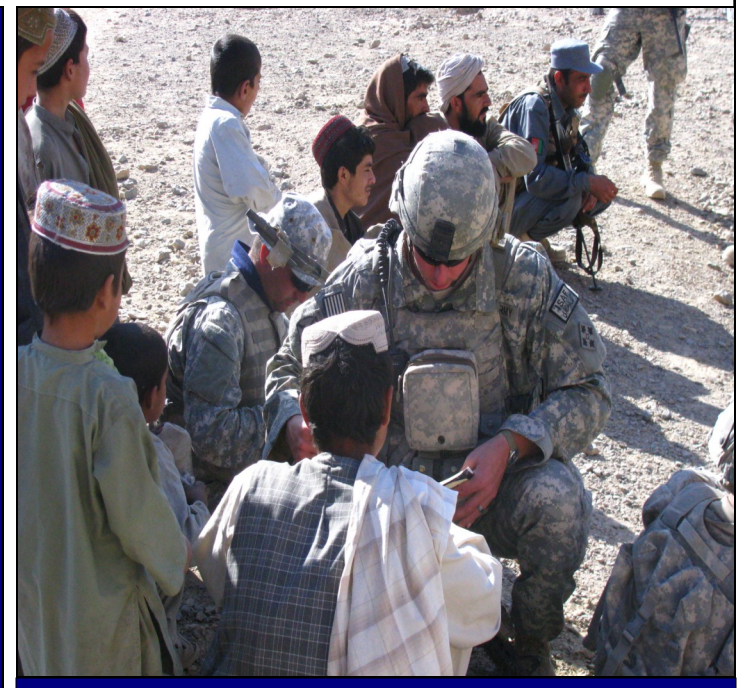
Bayonet Soldiers with ANP/ANA filling out census questions. The children like to gather as close as possible to see what is going on.

Of the village. Once they were set in, teams mixed with ANP and Bayonet Soldiers went through and took pictures while conducting a census of the locals in and around the town. This will help in future operations assisting the locals in the area and planning for local government improvements.